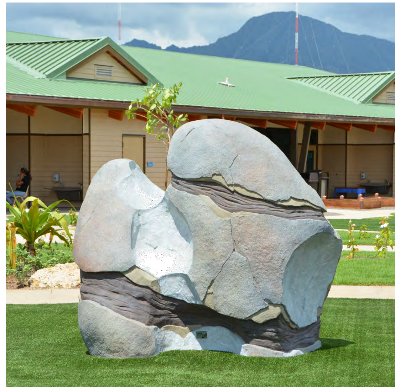
3 Kinesis Climber_SC030